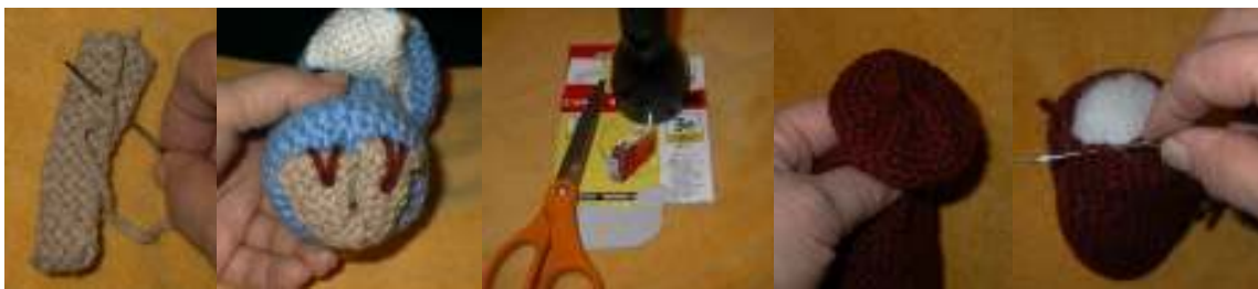
Roll feet, sew in place.