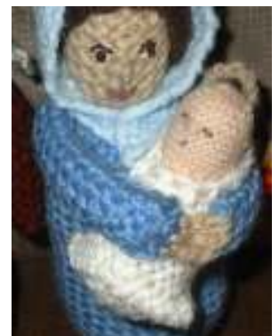
Cut circle, insert, stuff and gather ends. Baby >>